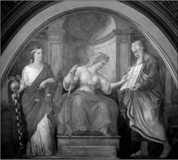
Authority Consults the Written Law , a fresco over the door to S-131

the Committee on the Judiciary before being transferred to Appropriations in 1947. In March 2013 the Senate designated S-126 as the “Senator Daniel K. Inouye Room,” in recognition of his service to the Senate and to the people of the United States. Rooms S-130 and 131 were once assigned to the Senate majority leader. A lunette over the door into S-131 depicts the fresco Authority Consults the Written Law , designed by Brumidi for the Committee on Revision of the Laws, which occupied the room at the time. In September 1996 the Senate designated S-131 as the “Mark Hatfield Room,” in honor of the former committee chairman.