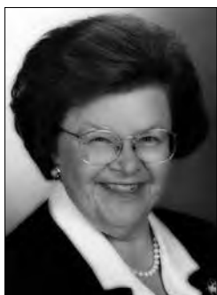
Barbara A. Mikulski (D-MD) Chairwoman 2012-Present

Senator Barbara A. Mikulski became the first woman and first Marylander to chair the Committee on December 20, 2012. She was first appointed to the committee in 1987. In addition to her full committee duties, she serves as chairwoman of the Subcommittee on Commerce, Justice, Science, and Related Agencies.