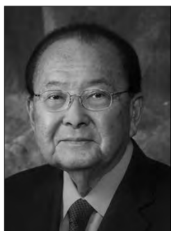
Daniel K. Inouye (D-HI) Chairman 2009–2012

Senator Daniel K. Inouye served on the Appropriations Committee from 1971 until his death in 2012. Born in Honolulu, Hawaii, on September 7, 1924, Inouye served in the U.S. Army's 442nd Regimental Combat Team during World War II. Composed of soldiers of Japanese ancestry, the 442nd became one of the most decorated military units in U.S. history. For his combat heroism, which cost him his right arm, Inouye was awarded the Congressional Medal of Honor, the Distinguished Service Cross, the Bronze Star, and the Purple Heart with Cluster. He entered political life after graduating from the University of Hawaii and the George Washington University Law School, becoming one of Hawaii's first representatives in Congress in 1959. Elected to the Senate in 1962, Inouye gained national distinction in the 1970s as a member of the Senate Watergate Committee and in 1987 as chairman of the Senate Iran-Contra Committee. He served as the Senate's president pro tempore from 2010 to 2012.