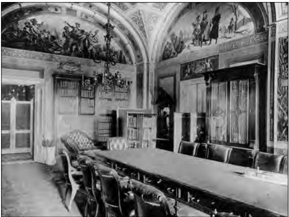
Room S-128 when used by the Senate Committee on Military Affairs, ca. 1900

The room itself was decorated over a 15-year period by Brumidi and English artist James Leslie; Brumidi painted the lunettes with Revolutionary War scenes— The Boston Massacre, 1770 ; The Battle of Lexington (1775) ; Death of General Wooster, 1777 ; Washington at Valley Forge, 1778 ; and Storming of Stony Point, 1779 —while Leslie painted the pilasters with elaborate military arms representing different historical periods. The ornate gilded valances and mirror over the marble mantel are also decorated with military accouterments. In a eulogy to Brumidi, shortly after his death, Senator Daniel Voorhees of Indiana praised the decorations and reflected: “Who ever passed through the room of the Committee on Military