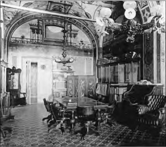
Room S-127 when used by the Senate Committee on the Philippines, ca. 1900

S-127. The main committee room was first occupied by the Committee on Naval Affairs, and the art reflects a naval theme. The decoration is in a style derived from ancient Roman wall paintings in the Baths of Titus and the excavations of Pompeii. As originally designed by Brumidi, the upper walls were to be filled with depictions of U.S. naval battles in illusionistic porticoes. Because of dissatisfaction with the artists who were to have carried out the work, only one scene was completed. The highly ornate ceiling as executed by Brumidi and his assistants is painted in fresco and tempera. Seven Roman gods and goddesses of the sea, together with America in the form of a Native American woman, dominate the ceiling. Interspersed throughout are scenes of mermaids, centaurs, eagles, Native Americans, and settlers. The walls depict classical maidens in flowing robes with various naval instruments. Other original details in the room include the marble mantel, gilded mirror, and wooden shutters. The central chandelier, originally gas-burning and purchased in 1873 for the White House, was later acquired for the Capitol and modified