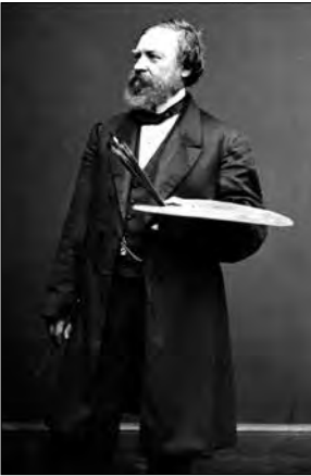
Constantino Brumidi, ca. 1866

The Senate Appropriations Committee's suite of offices is perhaps the most elegant of all Senate or House committee quarters. The seven rooms span the west side of the first floor in the Senate wing of the U.S. Capitol; the wing was built in the 1850s to accommodate the growing legislature. In 1911 the Appropriations Committee moved from second floor quarters into these rooms, first occupying rooms S-127, 128, and 129, and eventually expanding into adjacent rooms S-125, 126, 130, and 131.