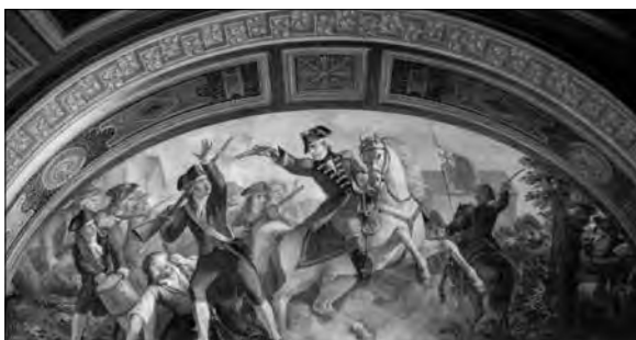
The Battle of Lexington, S-128

Affairs without the feeling that the very genius of heroism had left there its immortal aspirations?” The elaborate floor tiles were manufactured by Minton, Hollins and Company of Stoke-Upon-Trent, England. Despite nearly 150 years of service, the tiles remain in excellent condition due to a unique “encaustic” tile-making process that used layers of colored clay embedded in a neutral clay base to enhance color and durability.