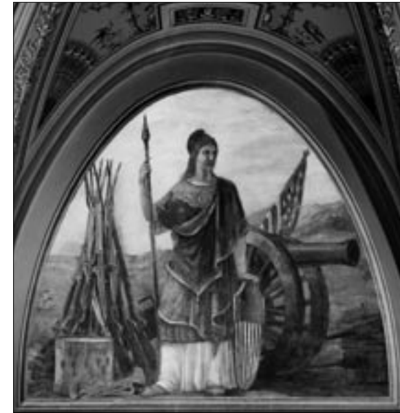
Bellona, the Roman Goddess of War , a fresco by Brumidi

Above room S-128 is the fresco titled Bellona, the Roman Goddess of War (A). Brumidi often related his art to the use of a room, and S-128 was first occupied by the Committee on Military Affairs. Throughout the west corridor are medallion portraits of signers of the Declaration of Independence including John Jay, Roger Sherman, and