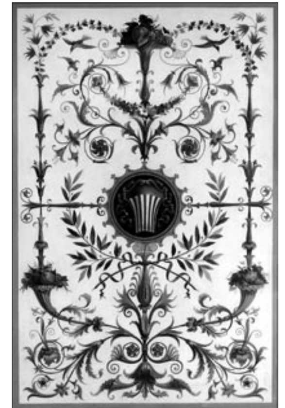
Restored lime-wash fresco in the Patent Corridor, by Brumidi