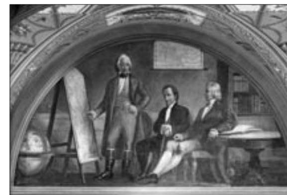
The Cession of Louisiana , a fresco by Brumidi

Brumidi employed an artistic technique known as trompe l'oeil (fool the eye) in the corridors. This process is designed to make the images appear three-dimensional rather than flat.