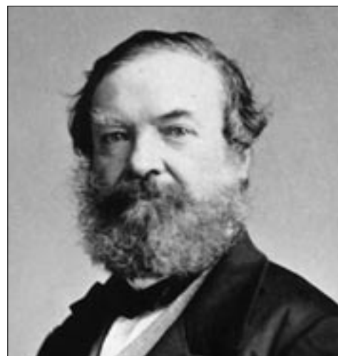
Constantino Brumidi (1805–1880)

By 1850, the Capitol needed additional room to accommodate the growing country, and extensions were designed to provide office space and new House and Senate chambers. In 1855, Captain Montgomery Meigs, Engineer of the Capitol