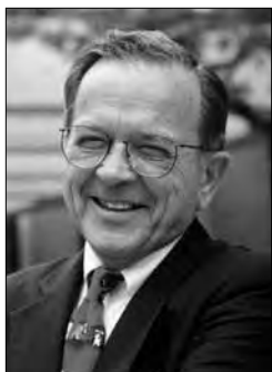
Ted Stevens (R-AK)

law and jurisprudence at Trinity College, University of Dublin, Ireland, and then graduated from the University of Mississippi Law School in 1965. Admitted to the Mississippi bar in 1965, Cochran practiced law until his election to the U.S. House of Representatives in 1972. He joined the Senate in 1978, becoming the first Republican in more than a century to win statewide election in Mississippi. Cochran continues to serve on the Appropriations Committee, where he is vice chairman of the Subcommittee on Defense. Cochran has also chaired the Senate Republican Conference and currently holds the position of ranking member on the Senate Committee on Agriculture, Nutrition and Forestry.