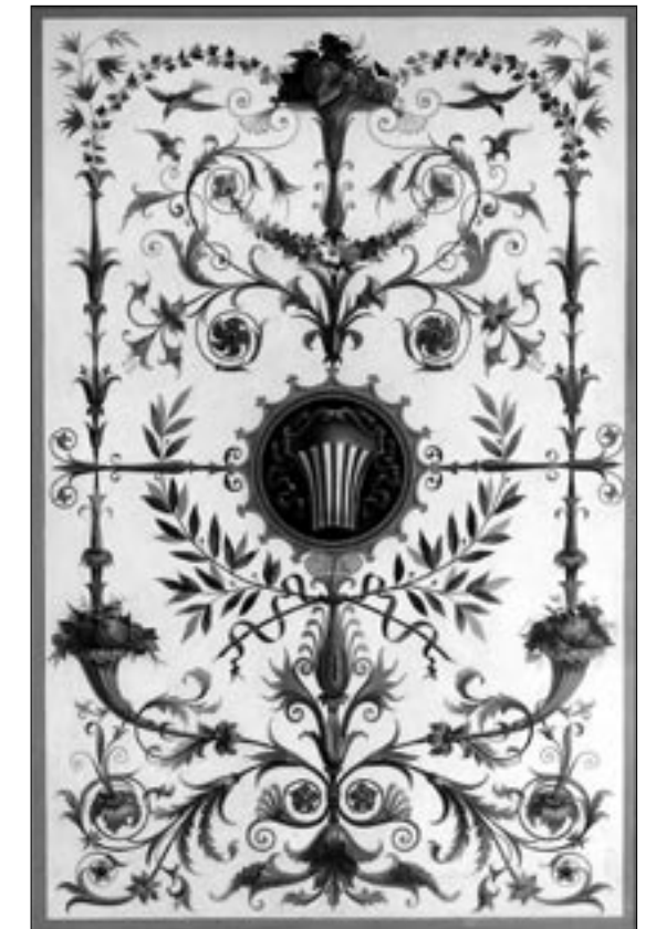
Restored lime-wash fresco in the Patent Corridor, by Brumidi