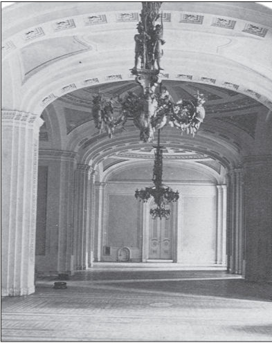
View of the principal corridor near the Senate Chamber from room S-224, ca. 1860

This desirable office space was first assigned to the Office of the Secretary of the Senate, whose responsibilities necessitate access to the Chamber floor. The secretary plays an essential role in the functioning of the Senate, overseeing an array of legislative, administrative, and financial services needed for the daily operation of the Senate.