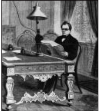
View of the room, April 1868

The Vice President's Room was initially furnished in a modest style. Few of those original pieces exist today, but the marble mantel and colorful Minton floor tiles manufactured in England are both part of the room's first decoration. Many of the room's present furnishings, such as the ornate gilded mirror and the matching Victorian window cornices, date to the late 19th century.