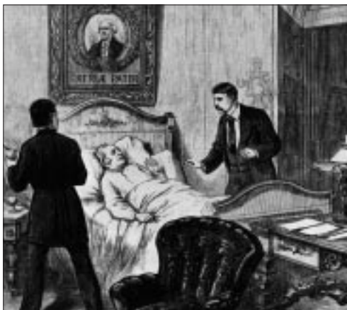
Death of Henry Wilson, 1875

Over the years, S-214 has provided a convenient place for the vice president to conduct business while at the Capitol. Until the Russell Senate Office Building opened in 1909, the room was the only space in the city assigned to the vice president, and it served as the sole working office for such men as Hannibal Hamlin, Chester Alan Arthur, and Theodore Roosevelt.