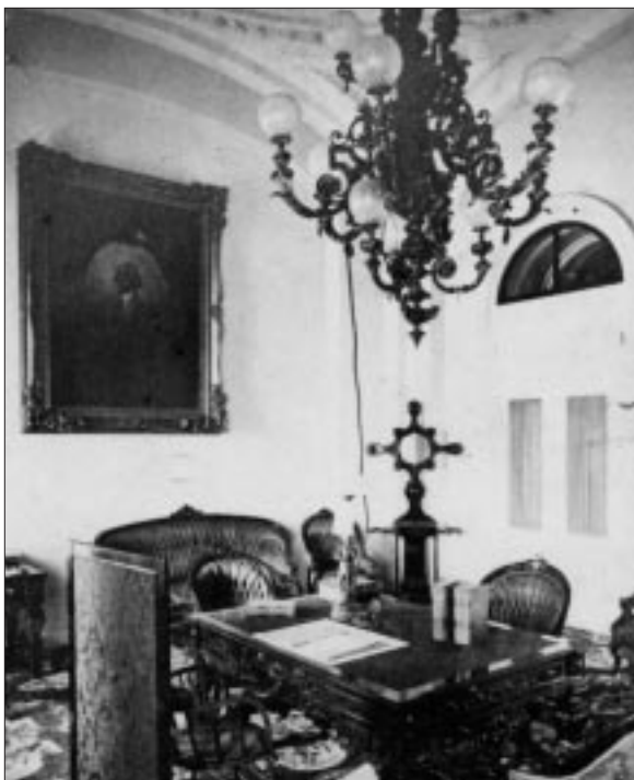
Earliest known photographic view of the room, c. 1870

The United States Constitution designates the vice president of the United States to serve as president of the Senate and to cast the tie-breaking vote in the case of a deadlock. To carry out these duties, the vice president has long had an office in the Capitol Building, just outside the Senate chamber.