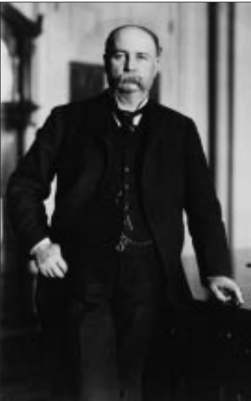
Vice President Garret A. Hobart

purchases of imported silk mohair carpeting, Neapolitan silk curtains, numerous Persian throw rugs, and “a silk velour slumber robe” made to order to match the velour cushions on his office sofa.