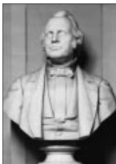
Henry Wilson by Daniel Chester French, 1885

In 1885, the Senate voted to place a marble bust of Henry Wilson in the Vice President's Room, to honor one of the Senate's most popular presiding officers. Before being elected vice president, Wilson had served as a senator from Massachusetts from 1855 to 1873. He played an important role during the Civil War, as chairman of the Senate Military Affairs Committee, and throughout his career championed legislation to aid the working class.