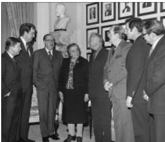
Prime Minister of Israel Golda Meir visits with former Vice President Hubert Humphrey (third from right) and other members of Congress in the Vice President's Room, 1974

The close proximity of the Vice President’s Room to the Senate chamber has allowed the vice president easy access to the members when the Senate is in session. For over 125 years, the room has provided an elegant and convenient setting for ceremonial functions, informal party caucuses, press briefings, and private meetings.